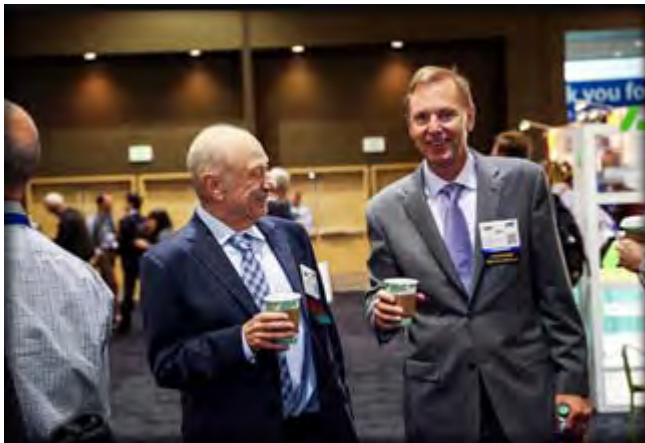
EXHIBIT HALL COFFEE SERVICE